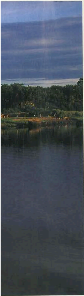
For many decades, Rhode Island's Weekapaug Inn has been a getaway of choice for knowledgeable honeymooners and vacationers. Now, after undergoing a stunning renovation, it's never been a more attractive (and romantic) destination.