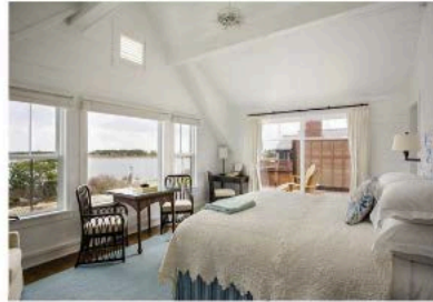
THE GREAT OUTDOORS From top: The restored Weekapaug Inn on Quonochontaug Pond; each room has a unique design.