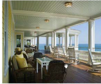
SEA CHANGE From top: The terrace views at Ocean House; the revamped Sea Room lounge at Weekapaug Inn; boating on Quonochontaug Pond

The newly revamped resort also offers 27 uniquely decorated larger guest rooms (down from 67). Though feather-top beds dressed in Frette linens and holdover furnishings culled from the original structure tempt me to describe these spaces as cozy, the collection is also sleek—high-end amenities like heated marble bathroom floors; Red Flower bath products; and gorgeous, claw-footed soaking tubs are among the indulgences. But it is the small service touches—like an impossibly warm blanket placed on your bed