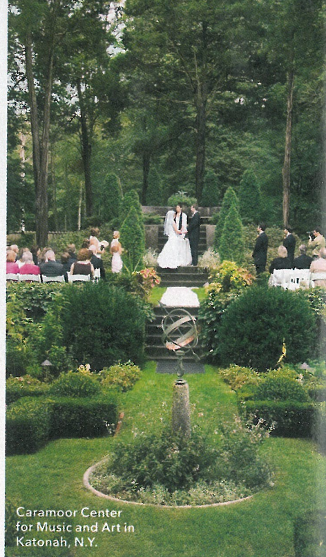
Caramoor Center for Music and Art in Katonah, N.Y.