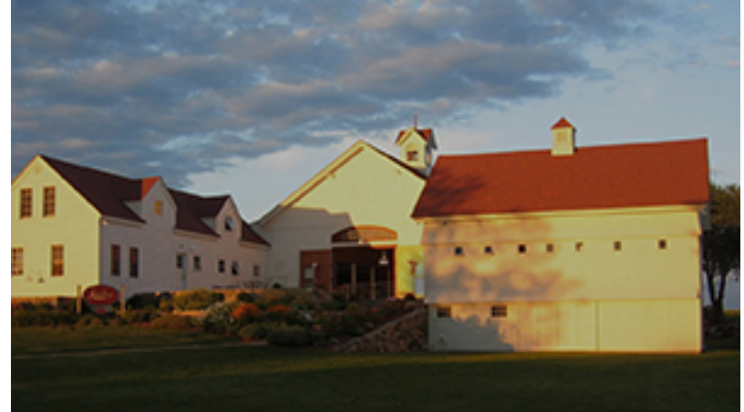
Jonathan Edwards Winery, The Wines

There's good reason Rhode Island is called the Ocean State, and one of those is Napatree Point. The Westerly beach is approximately 1.5 miles long and separates Rhode Island and Connecticut. Visit here any time of year and walk along the bluffs or dip your toes in the water. Stop by Fort Mansfield, located toward the end of Napatree where the river merges into the ocean. Meander along with your camera in tow — many a painting has been inspired by this scenery.