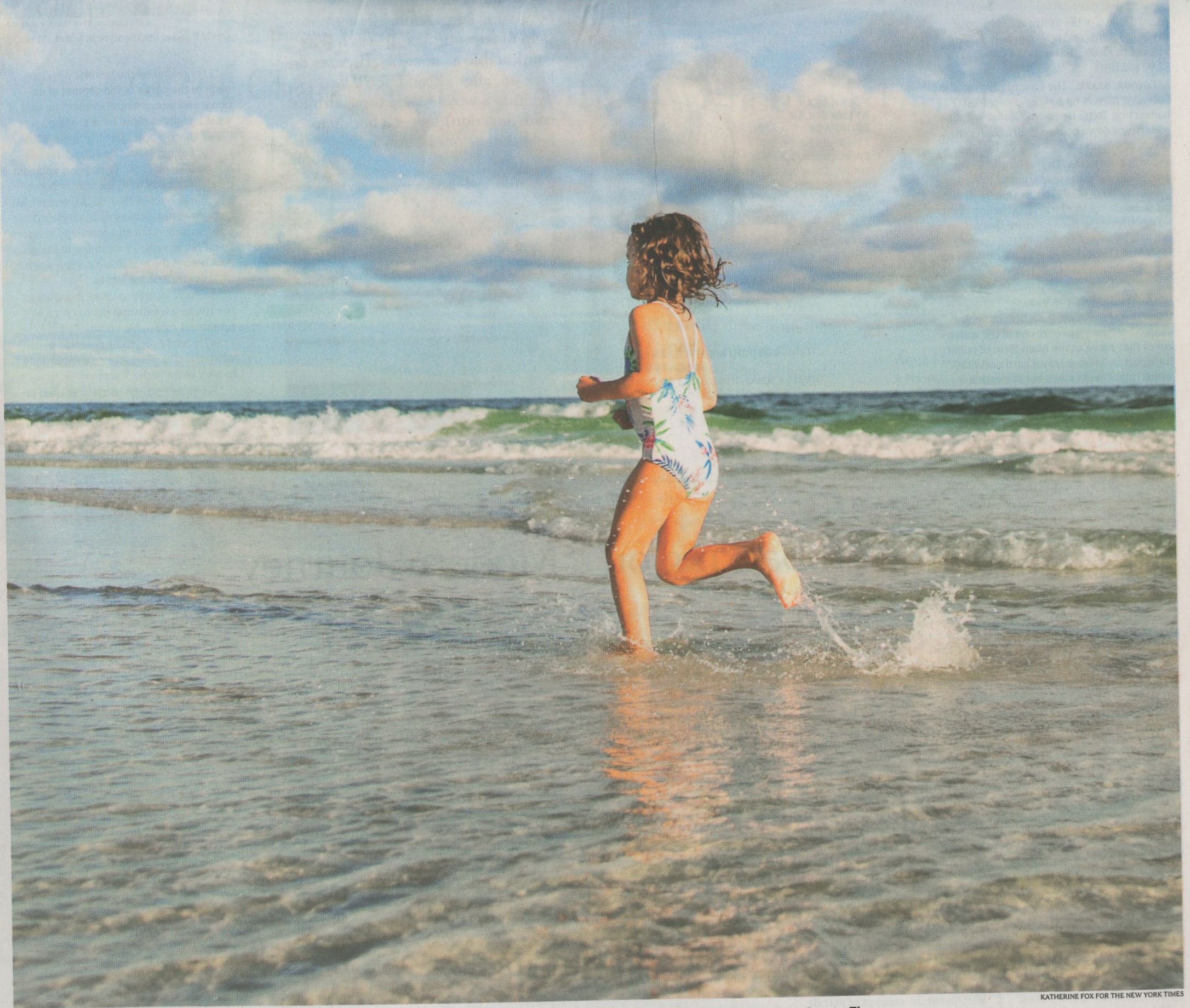
Enjoying the water on Blue Mountain Beach in Walton County, Fla.