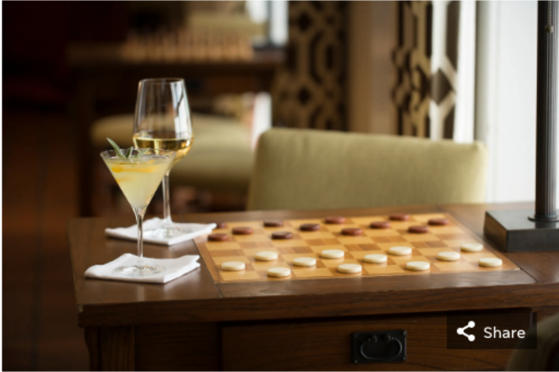
Garden Room at Weekapaug Inn in Westerly, Rhode Island