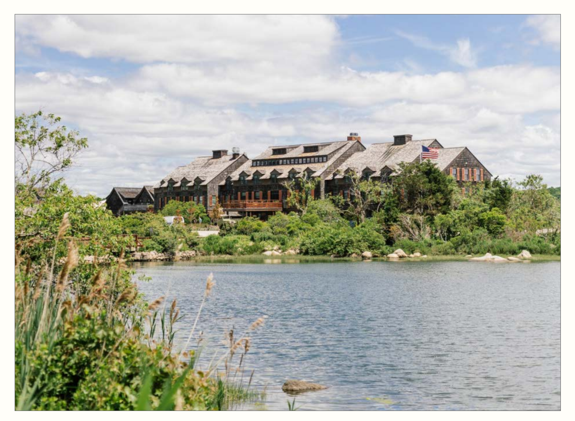
Weekapaug Inn, Westerly, Rhode Island