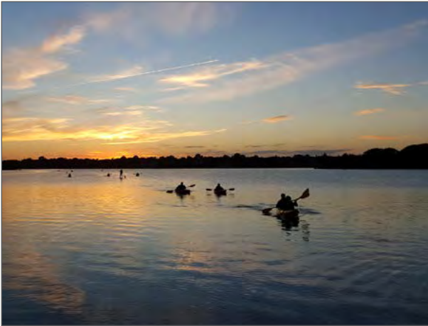
Kayaking & Paddleboarding