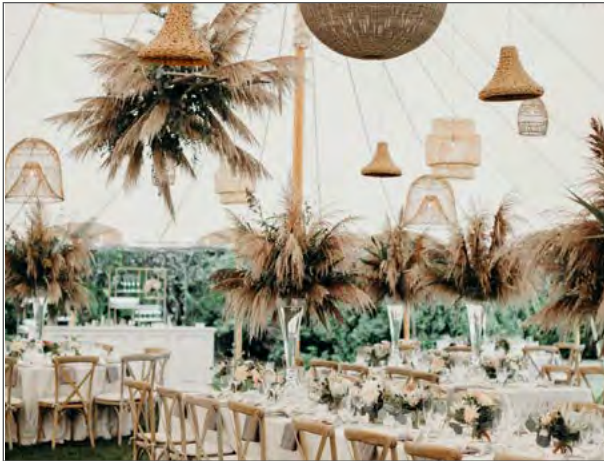
Lighting & Design