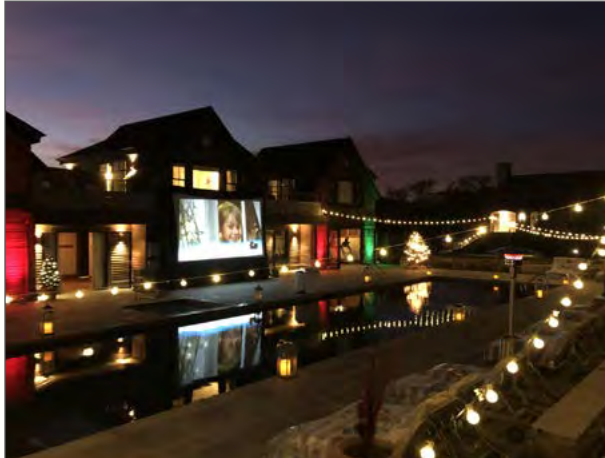
Pool Movie Night