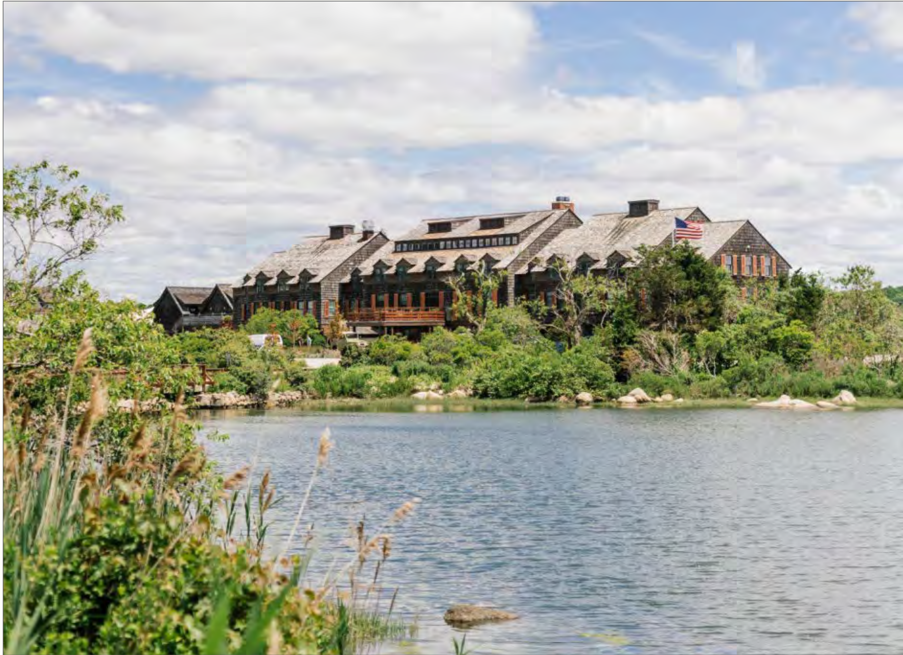
Weekapaug Inn, Westerly, Rhode Island