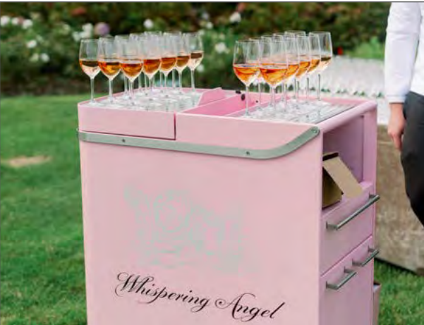
Whispering Angel Cart