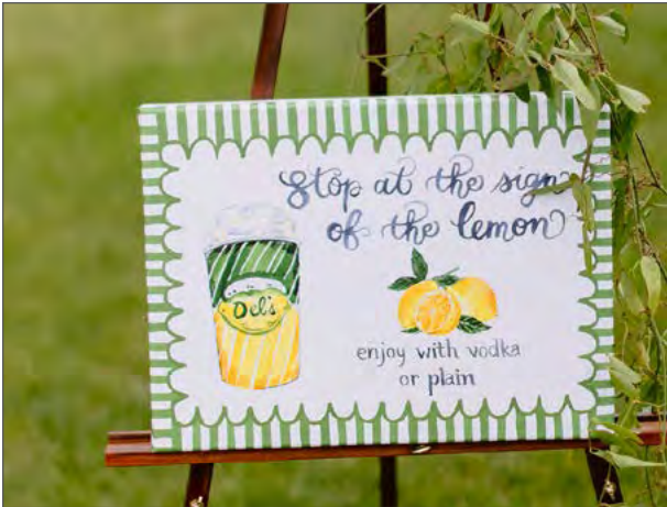
Del's Lemonade Cart