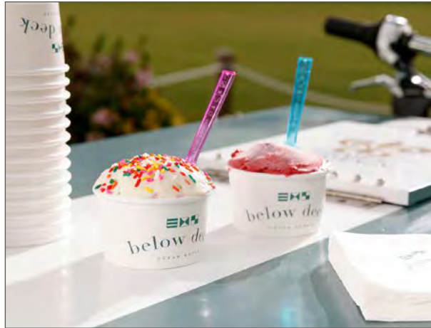
Below Deck Cart