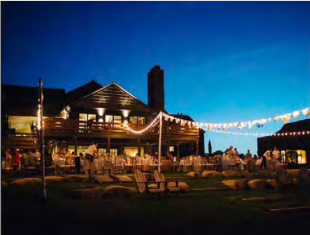
The Restaurant Terrace & Amphitheater