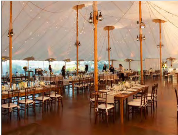
Full Tent Flooring